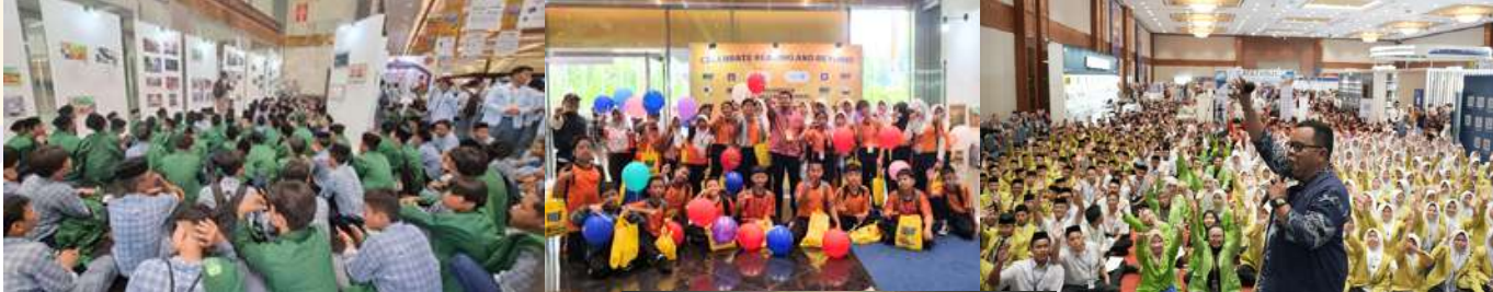
Writer of the Year IKAPI AWARDS 2024